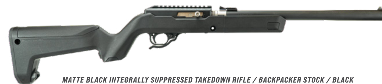
MATTE BLACK INTEGRALLY SUPPRESSED TAKEDOWN RIFLE / BACKPACKER STOCK / BLACK