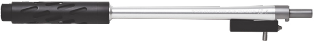
SILVER X-RING TAKEDOWN SBX BARREL FOR RUGER® 10/22 TAKEDOWN® RIFLES [ INCLUDES INERT SUPPRESSOR ]