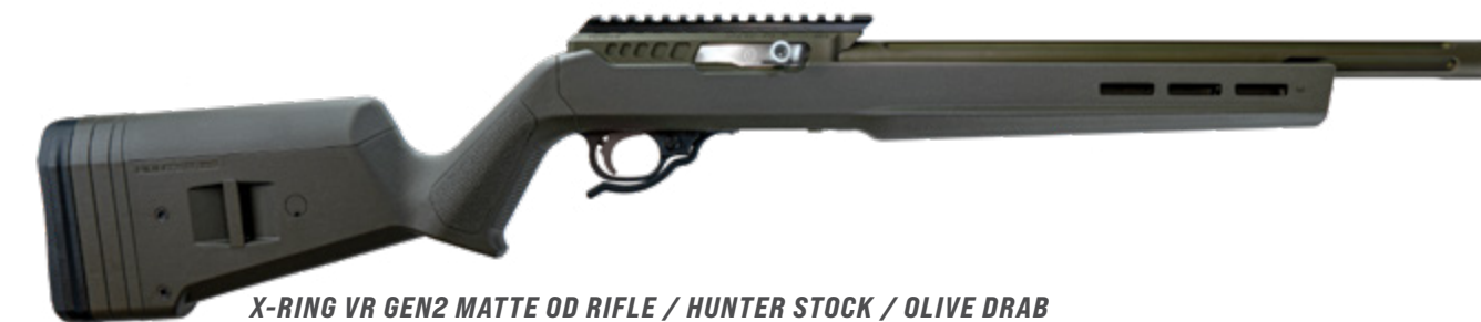
X-RING VR GEN2 MATTE OD RIFLE / HUNTER STOCK / OLIVE DRAB