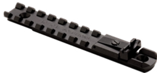
INTEGRAL SCOPE RAIL W/ REAR SIGHT FOR TRAIL-LITE BARREL UPGRADES AND BROWNING® BUCK MARK® PISTOLS