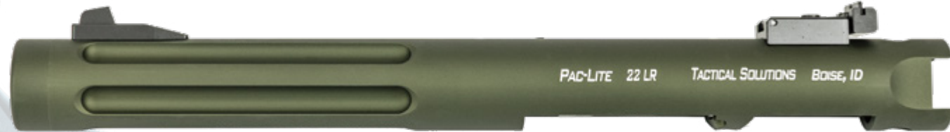
MATTE OLIVE DRAB PAC-LITE 6" BARREL - FLUTED [ SERIALIZED ITEM. 4473 / FFL TRANSFER REQUIRED ]

PAC-LITE and PAC-LITE IV BARRELS are ultra-lightweight, accurate, match-quality upgrades for the Ruger® Mark I, II, III, IV and Ruger 22/45™ pistols.