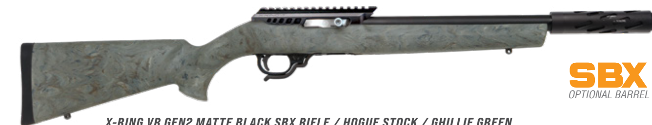
X-RING VR GEN2 MATTE BLACK SBX RIFLE / HOGUE STOCK / GHILLIE GREEN