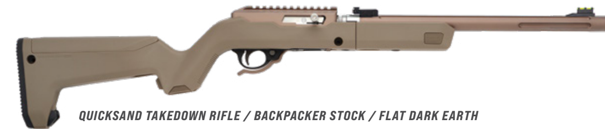
QUICKSAND TAKEDOWN RIFLE / BACKPACKER STOCK / FLAT DARK EARTH