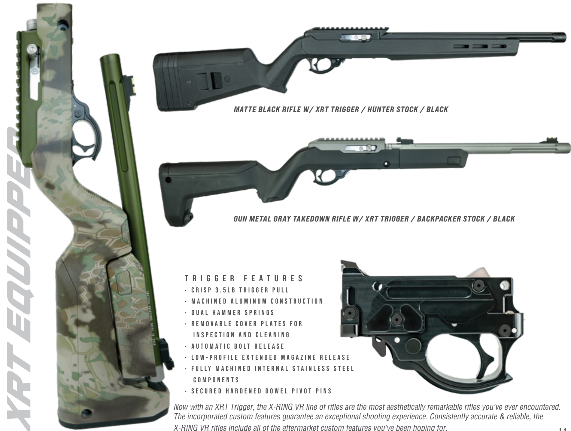
MATTE BLACK RIFLE W/ XRT TRIGGER / HUNTER STOCK / BLACK