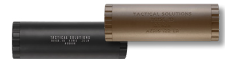
AERIS MICRO RIMFIRE SUPPRESSOR / FDE - NEW FOR 2025 .22LR, .17HM2, .22WMR, .17HMR AND .17WSM

[ NFA REGULATED ITEM. A TAX STAMP IS REQUIRED ]