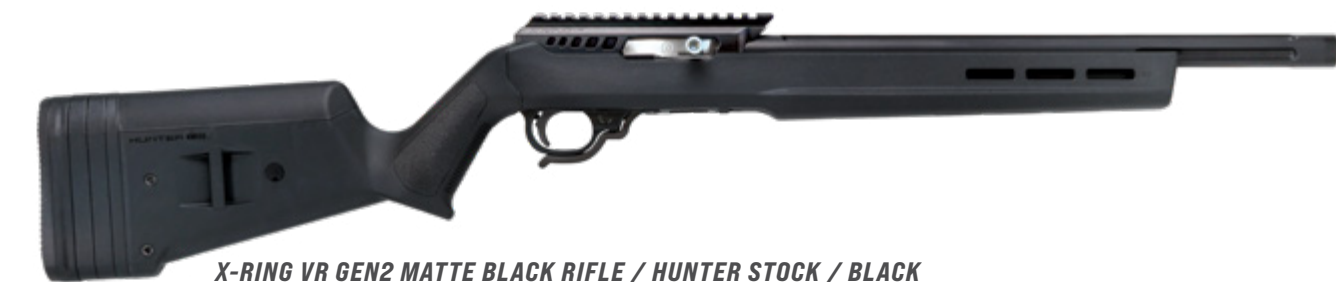
X-RING VR GEN2 MATTE BLACK RIFLE / HUNTER STOCK / BLACK

The X-RING VR line of rifles are the most aesthetically remarkable firearms you've ever encountered. The incorporated custom features guarantee an exceptional shooting experience. Consistently accurate & reliable, the X-RING VR rifles include all of the aftermarket custom features you've been hoping for. And with many color options to choose from, you're certain to find your perfect rifle.