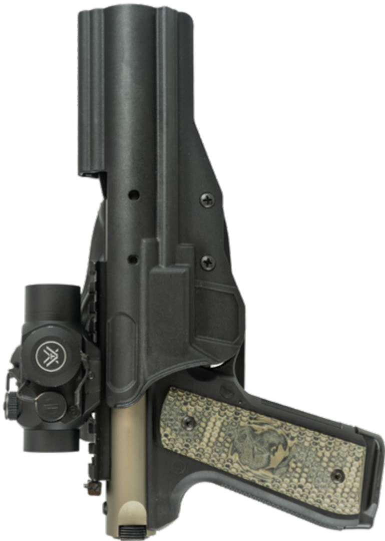
PAC-LITE MK SERIES HOLSTER FOR RUGER® MARK SERIES AND 22/45® PISTOLS

The TacSol accessories for Ruger® Mark Series pistols, Browning® Buck Mark® pistols, Pac-Lite and Trail-Lite barrels are the perfect upgrades to improve your shooting experience.