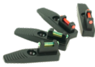
FIBER OPTIC SIGHTS FOR TRAIL-LITE AND PAC-LITE BARRELS AVAILABLE IN RED AND GREEN

[ For Custom Color Options See Table of Contents ]