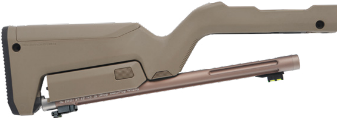
QUICKSAND X-RING TAKEDOWN BARREL W/ MAGPUL® X-22 BACKPACKER STOCK / FLAT DARK EARTH

TacSol X-RING Takedown Barrel and Stock combos are ultra-lightweight and highly accurate .22 LR rifle upgrades with Magpul® X-22 Backpacker stocks for the Ruger® 10/22 Takedown®.