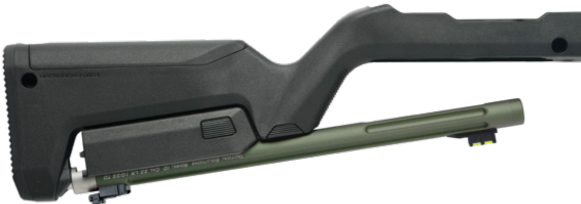
MATTE OLIVE DRAB X-RING TAKEDOWN BARREL W/ MAGPUL® X-22 BACKPACKER STOCK / BLACK