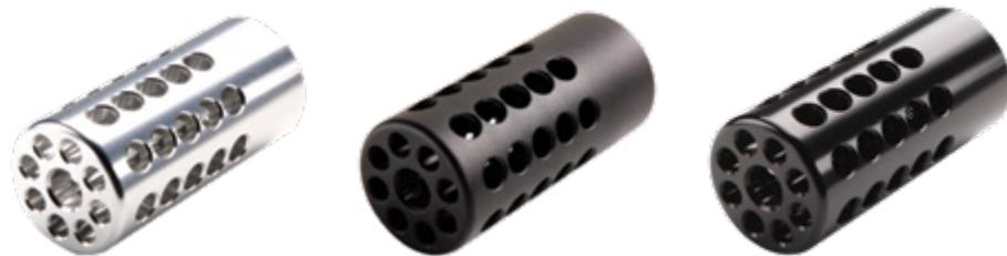
TRAIL-LITE COMP .22LR 0.900" DIAMETER 1/2" X 28 SILVER, MATTE BLACK, AND GLOSS BLACK

[ For Custom Color Options See Table of Contents ]