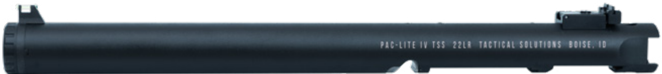
INTEGRALLY SUPPRESSED PAC-LITE IV TSS .22 LR

[ NFA REGULATED ITEM. A TAX STAMP IS REQUIRED ]