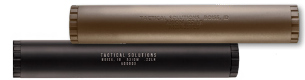
AXIOM SUPPRESSOR / FDE - NEW FOR 2025 .22LR, .17HM2, .22WMR, .17HMR, .17WSM, .22 HORNET AND 5.7X28

[ NFA REGULATED ITEM. A TAX STAMP IS REQUIRED ]