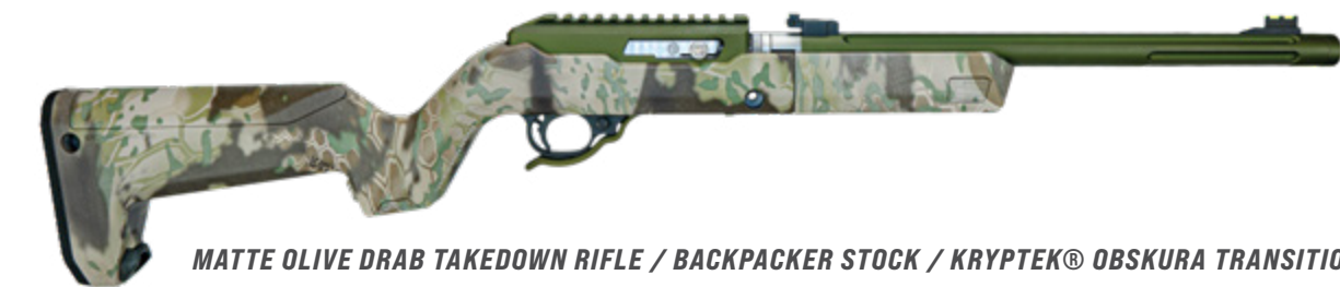
MATTE OLIVE DRAB TAKEDOWN RIFLE / BACKPACKER STOCK / KRYPTEK® OBSKURA TRANSITIONAL

The X-RING VR Takedown series rifles are intended for all shooters; from the everyday plinker to the avid outdoorsman. Its unique take-down design and accessibility make it an incredibly useful tool for every aspect of survival, target practice, and quick varmint dispatch. With many color options to choose from, you're certain to find your perfect rifle.