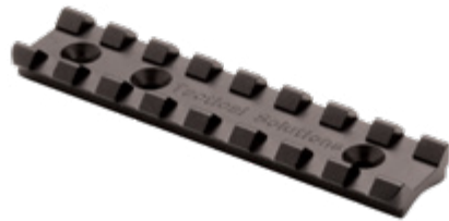
STANDARD STYLE RAIL FOR PAC-LITE BARREL UPGRADES