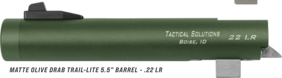
MATTE OLIVE DRAB TRAIL-LITE 5.5" BARREL - .22 LR