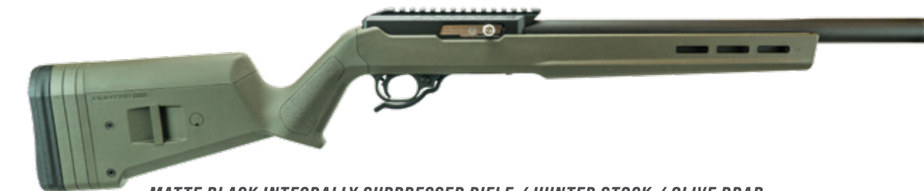
MATTE BLACK INTEGRALLY SUPPRESSED RIFLE / HUNTER STOCK / OLIVE DRAB