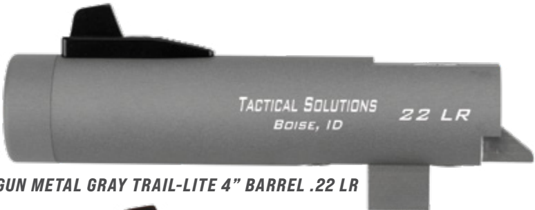
GUN METAL GRAY TRAIL-LITE 4" BARREL .22 LR