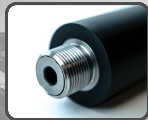
STAINLESS STEEL THREADS