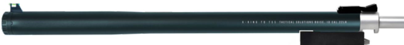
X-RING TAKEDOWN TSS INTEGRALLY SUPPRESSED BARREL .22 LR

[ NFA REGULATED ITEM. A TAX STAMP IS REQUIRED ]