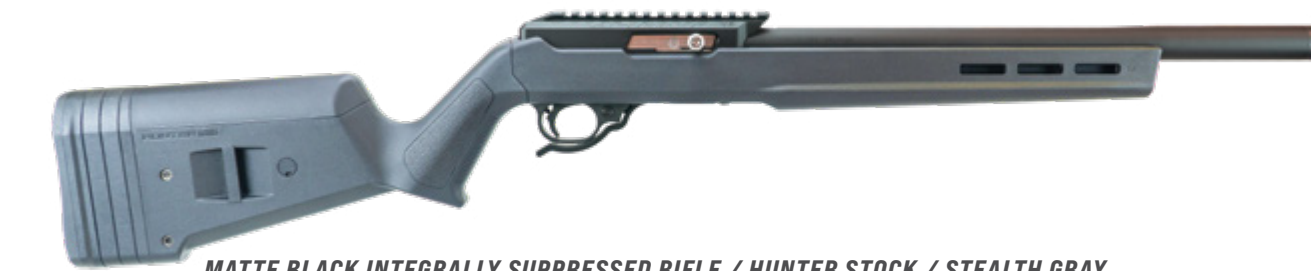
MATTE BLACK INTEGRALLY SUPPRESSED RIFLE / HUNTER STOCK / STEALTH GRAY