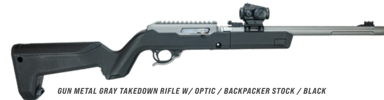
GUN METAL GRAY TAKEDOWN RIFLE W/ OPTIC / BACKPACKER STOCK / BLACK