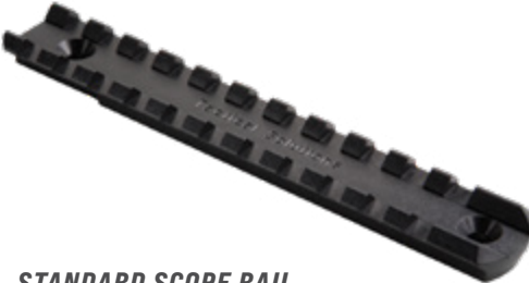
STANDARD SCOPE RAIL FOR TRAIL-LITE BARREL UPGRADES AND BROWNING® BUCK MARK® PISTOLS