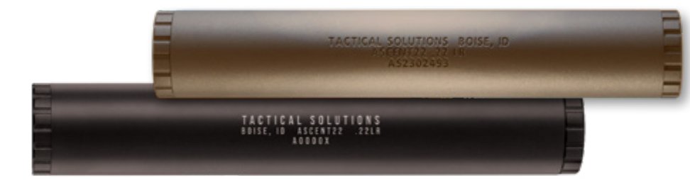
ASCENT22 SUPPRESSOR / FDE - NEW FOR 2025 .22LR, .17HM2, .22WMR, .17HMR AND .17WSM

[ NFA REGULATED ITEM. A TAX STAMP IS REQUIRED ]