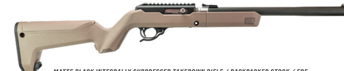
MATTE BLACK INTEGRALLY SUPPRESSED TAKEDOWN RIFLE / BACKPACKER STOCK / FDE

We've taken the same great features found on our X-Ring VR and X-Ring VR TD rifles and made everything much quieter with an integral suppressor. 4 magpul Backpacker stock colors to choose from.