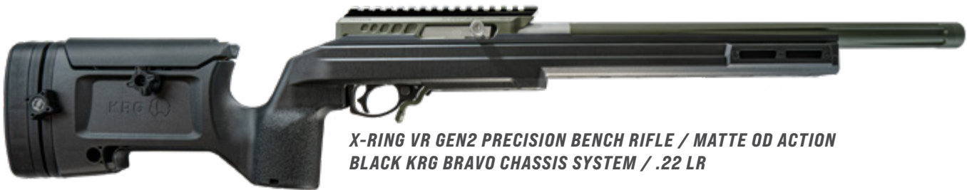
X-RING VR GEN2 PRECISION BENCH RIFLE / MATTE OD ACTION BLACK KRG BRAVO CHASSIS SYSTEM / .22 LR