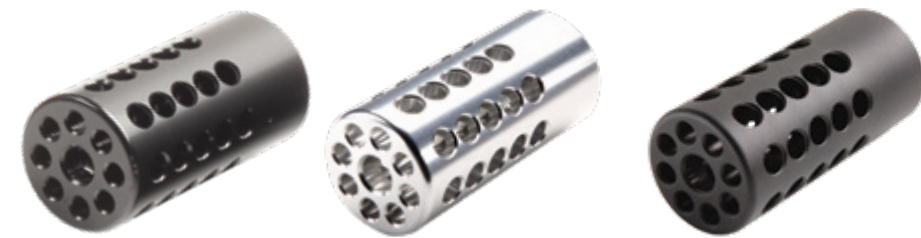
PAC-LITE COMP .22LR 1" DIAMETER 1/2" X 28 GLOSS BLACK, SILVER, AND MATTE BLACK

[ For Custom Color Options See Table of Contents ]