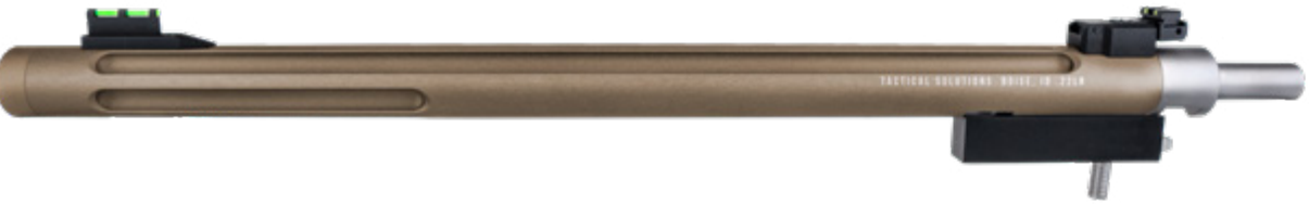
QUICKSAND X-RING TAKEDOWN BARREL FOR RUGER® 10/22 TAKEDOWN® RIFLES