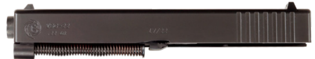
CONVERSION FOR GLOCK® MODEL 17/22 / NON-THREADED STANDARD END .22 LR