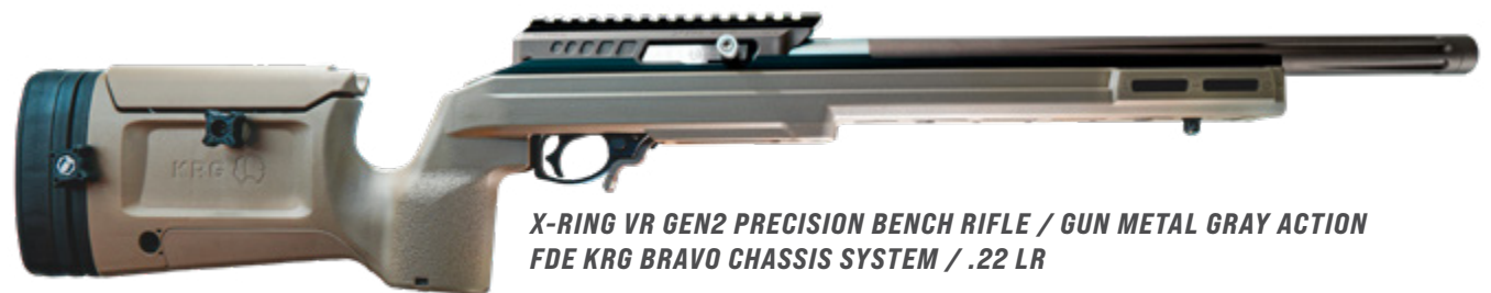
X-RING VR GEN2 PRECISION BENCH RIFLE / GUN METAL GRAY ACTION FDE KRG BRAVO CHASSIS SYSTEM / .22 LR