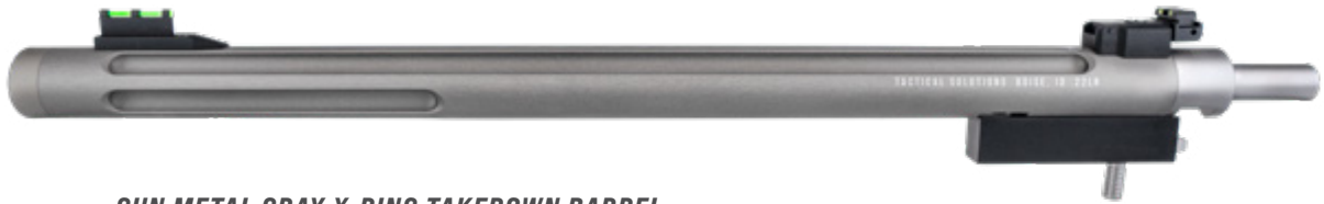
GUN METAL GRAY X-RING TAKEDOWN BARREL FOR RUGER® 10/22 TAKEDOWN® RIFLES

BARREL UPGRADES FOR RUGER® 10/22 TAKEDOWN® RIFLES