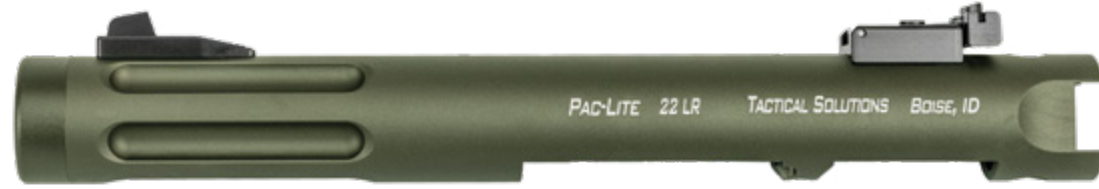
MATTE OLIVE DRAB PAC-LITE 4.5" BARREL - FLUTED [ SERIALIZED ITEM. 4473 / FFL TRANSFER REQUIRED ]