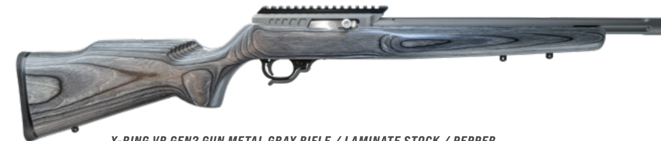
X-RING VR GEN2 GUN METAL GRAY RIFLE / LAMINATE STOCK / PEPPER