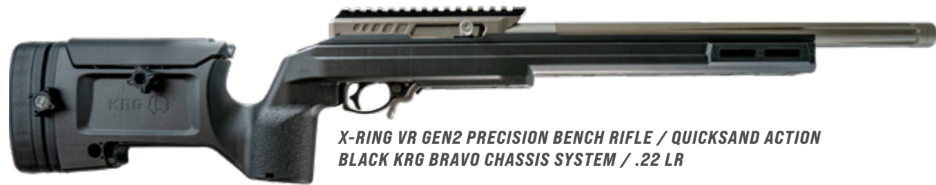
X-RING VR GEN2 PRECISION BENCH RIFLE / QUICKSAND ACTION BLACK KRG BRAVO CHASSIS SYSTEM / .22 LR