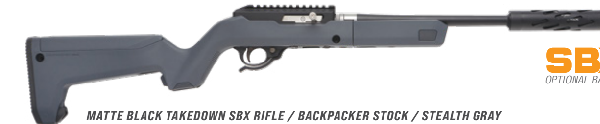
MATTE BLACK TAKEDOWN SBX RIFLE / BACKPACKER STOCK / STEALTH GRAY