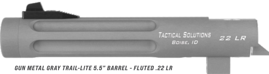
GUN METAL GRAY TRAIL-LITE 5.5" BARREL - FLUTED .22 LR

The TacSol TRAIL-LITE barrel is an ultra-lightweight and accurate .22 LR upgrade for the Browning® Buck Mark® pistol. The TRAIL-LITE upgrade represents what TacSol is known for; lightweight, highly accurate, and easy-to-install barrels.