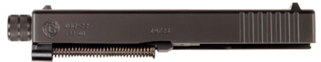
CONVERSION FOR GLOCK® MODEL 19/23 / THREADED END .22 LR