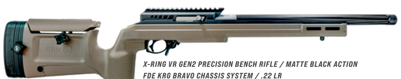
X-RING VR GEN2 PRECISION BENCH RIFLE / MATTE BLACK ACTION FDE KRG BRAVO CHASSIS SYSTEM / .22 LR

X-RING VR Gen2 Precision Bench Rifles are set apart from the competition, machined from 6061-T6 aluminum, our precise and superior construction methods make for an accurate and consistently functional firearm. The X-RING VR Gen2 Rifles exemplify elite rimfire performance. When accuracy, functionality, and consistency are crucial, the redesigned X-RING platform is undeniably capable and reliable. We've taken an already proven firearm design and made it even better. 10 color options to choose from.