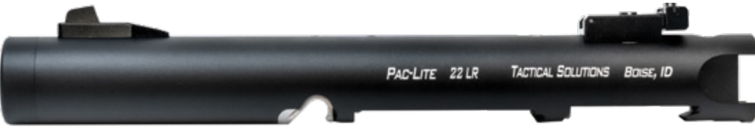
MATTE BLACK PAC-LITE IV 4.5" BARREL [ SERIALIZED ITEM. 4473 / FFL TRANSFER REQUIRED ]