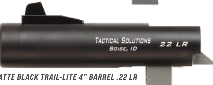
MATTE BLACK TRAIL-LITE 4" BARREL .22 LR