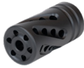
PAC-LITE PERFORMANCE COMP .22LR 1" DIAMETER 1/2" X 28 MATTE BLACK

[ For Custom Color Options See Table of Contents ]