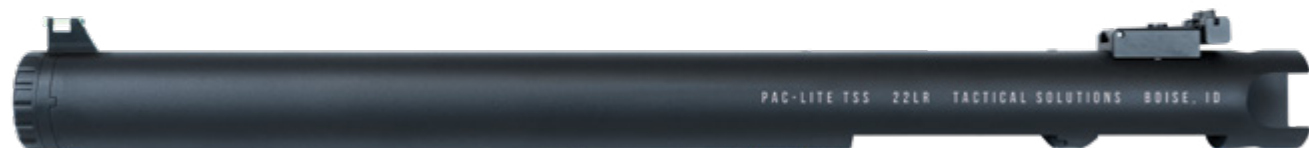
INTEGRALLY SUPPRESSED PAC-LITE TSS .22 LR

Our newly designed Clean-Lok™ baffle system reduces fouling and makes the need to clean less frequent and easier.