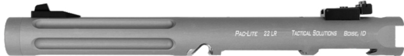
GUN METAL GRAY PAC-LITE IV 6" BARREL - FLUTED [ SERIALIZED ITEM. 4473 / FFL TRANSFER REQUIRED ]